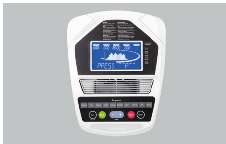
Contact and wireless heart rate monitoring capabilities