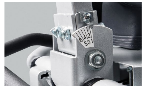
Recumbent position reduces strain on joints and muscles